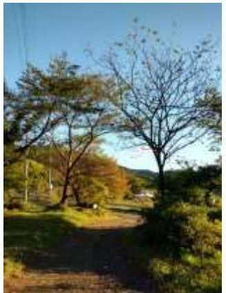
Re-Inventing Japan Project (RJP) Internship was the last program. I was carried out at the Institute of